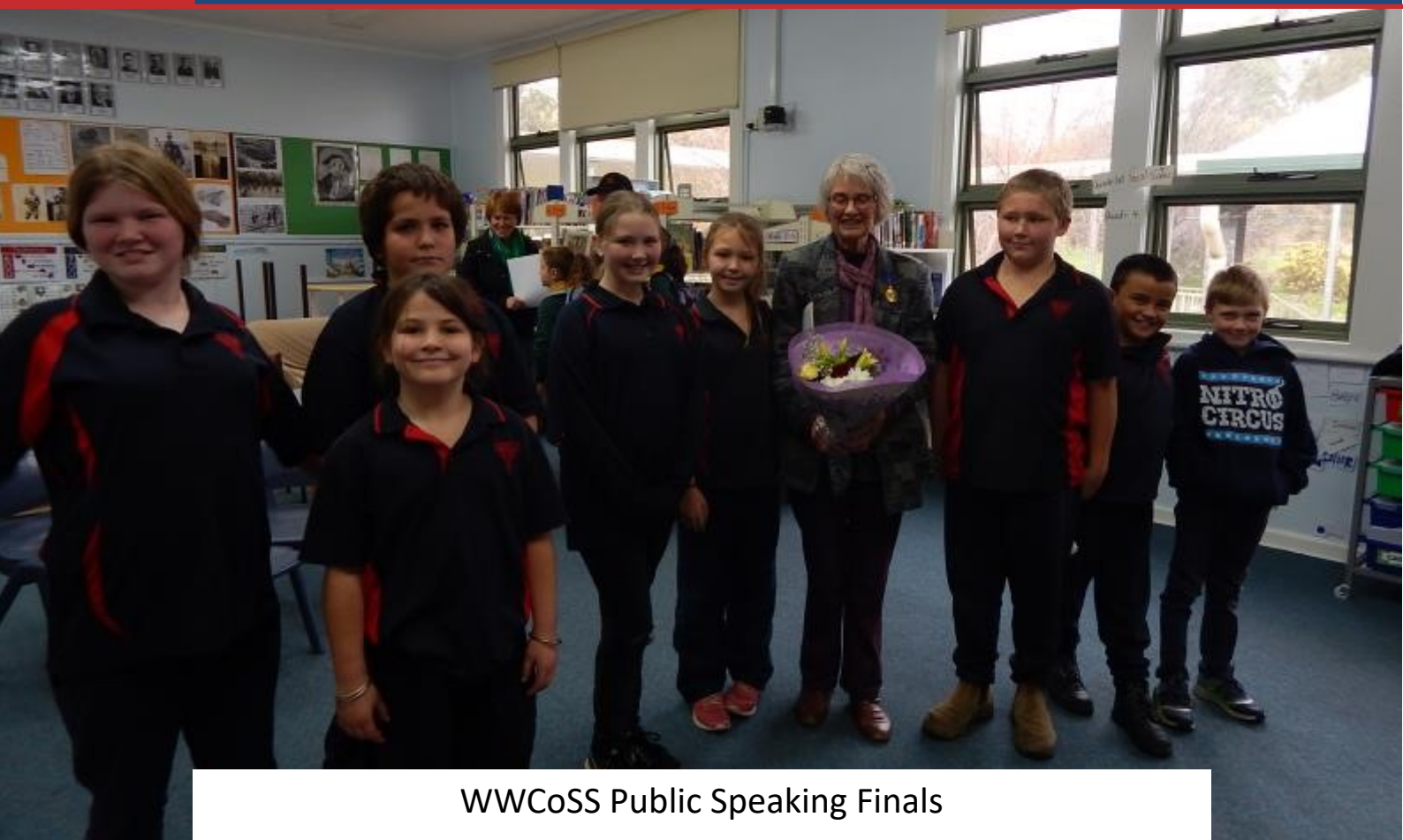
WWCoSS Public Speaking Finals