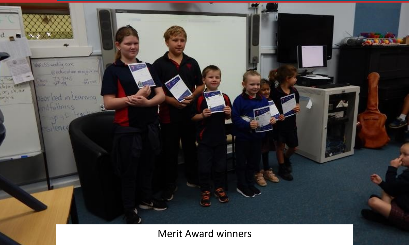
Merit Award winners