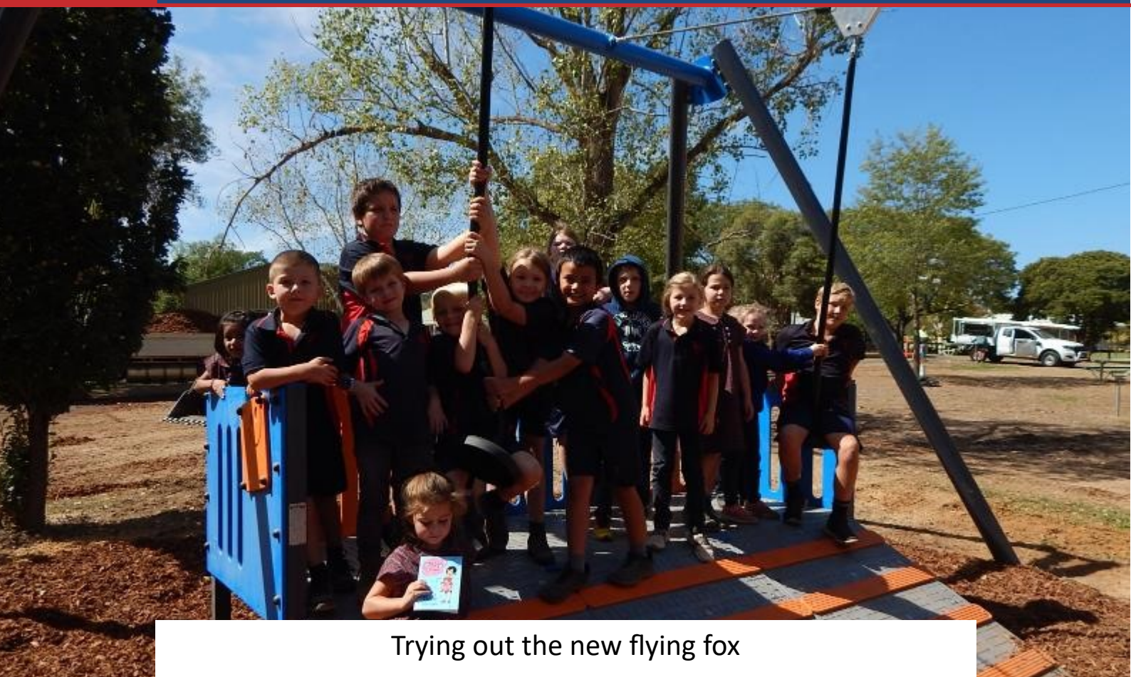
Trying out the new flying fox