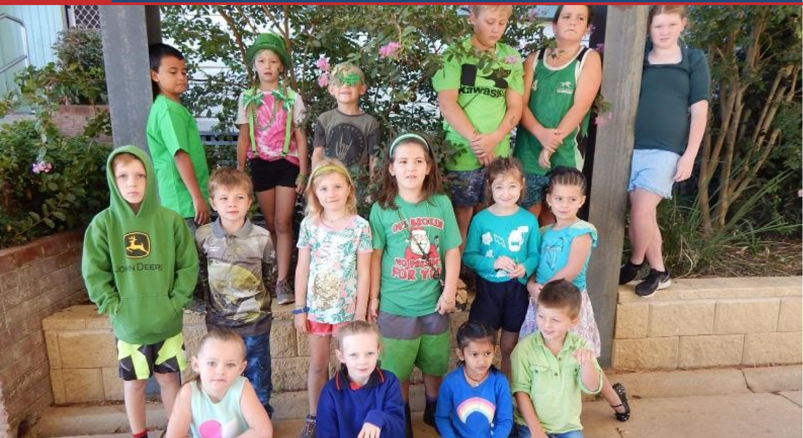
Having fun celebrating St. Patrick's Day