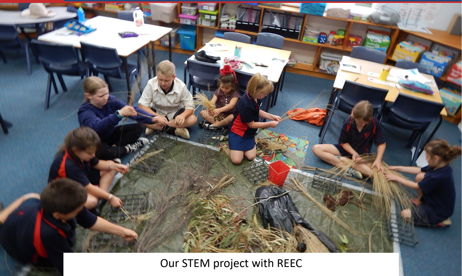
Our STEM project with REEC