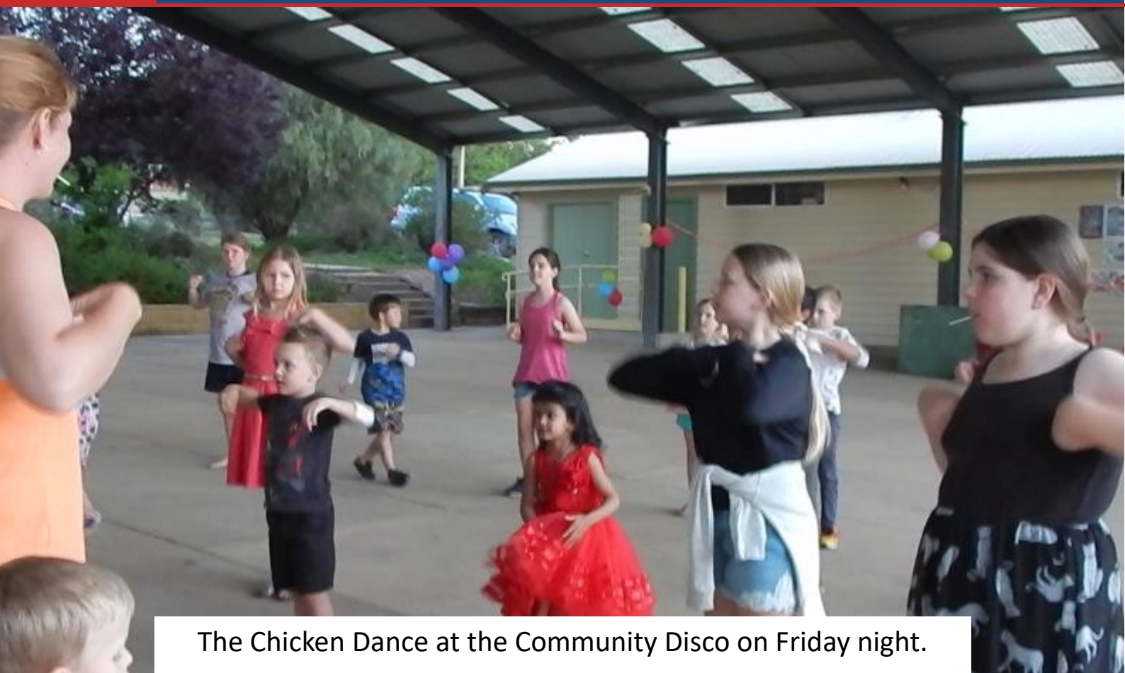
The Chicken Dance at the Community Disco on Friday night.