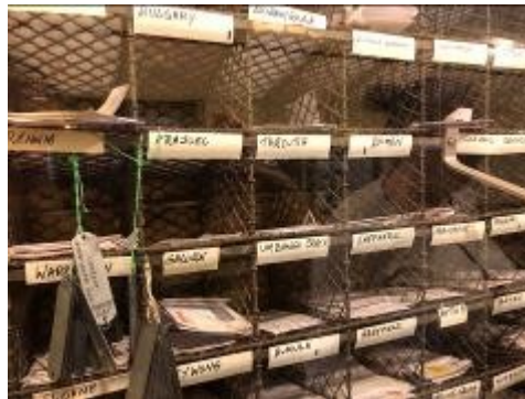
These are all of the mail boxes because the train is delivering mail to the post offices in the different towns.—by Ariella