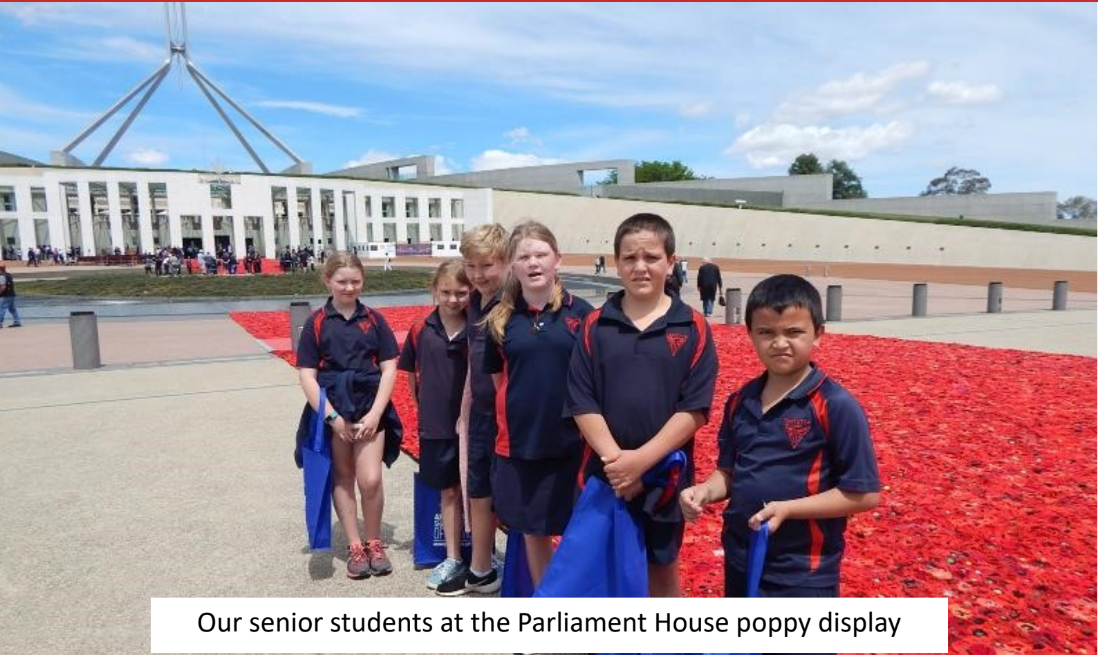
Our senior students at the Parliament House poppy display