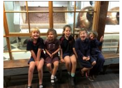
The K-2 students are sitting in front of the chocolate tumbling machine at the Junee Chocolate Factory.—by Lailah