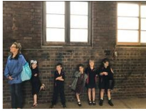
The K-2 students are standing near the wall at the Roundhouse Museum